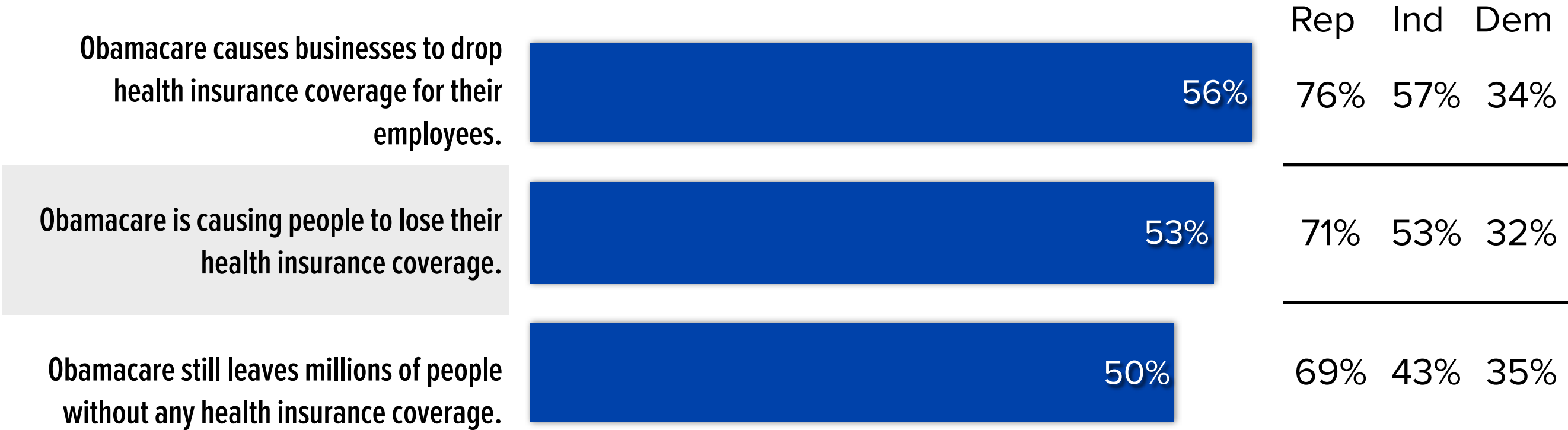
Percent "Very Persuasive" Among All

Now I'm going to read you several criticisms some people have made about Obamacare. For each one, would you please tell me if you think that criticism is a very persuasive, somewhat persuasive, or not too persuasive reason to oppose Obamacare.